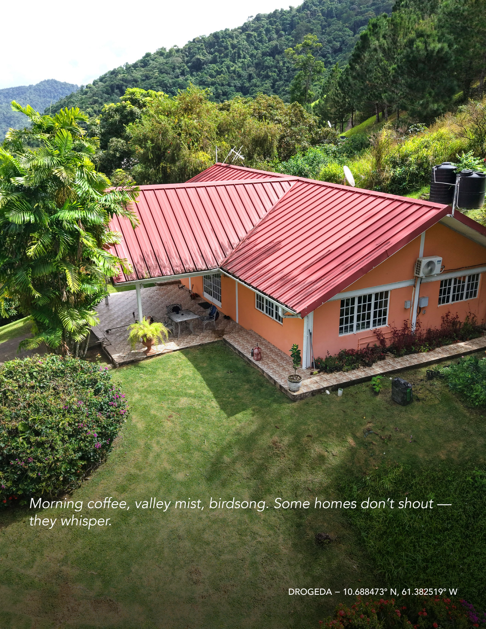
Morning coffee, valley mist, birdsong. Some homes don't shout — they whisper.